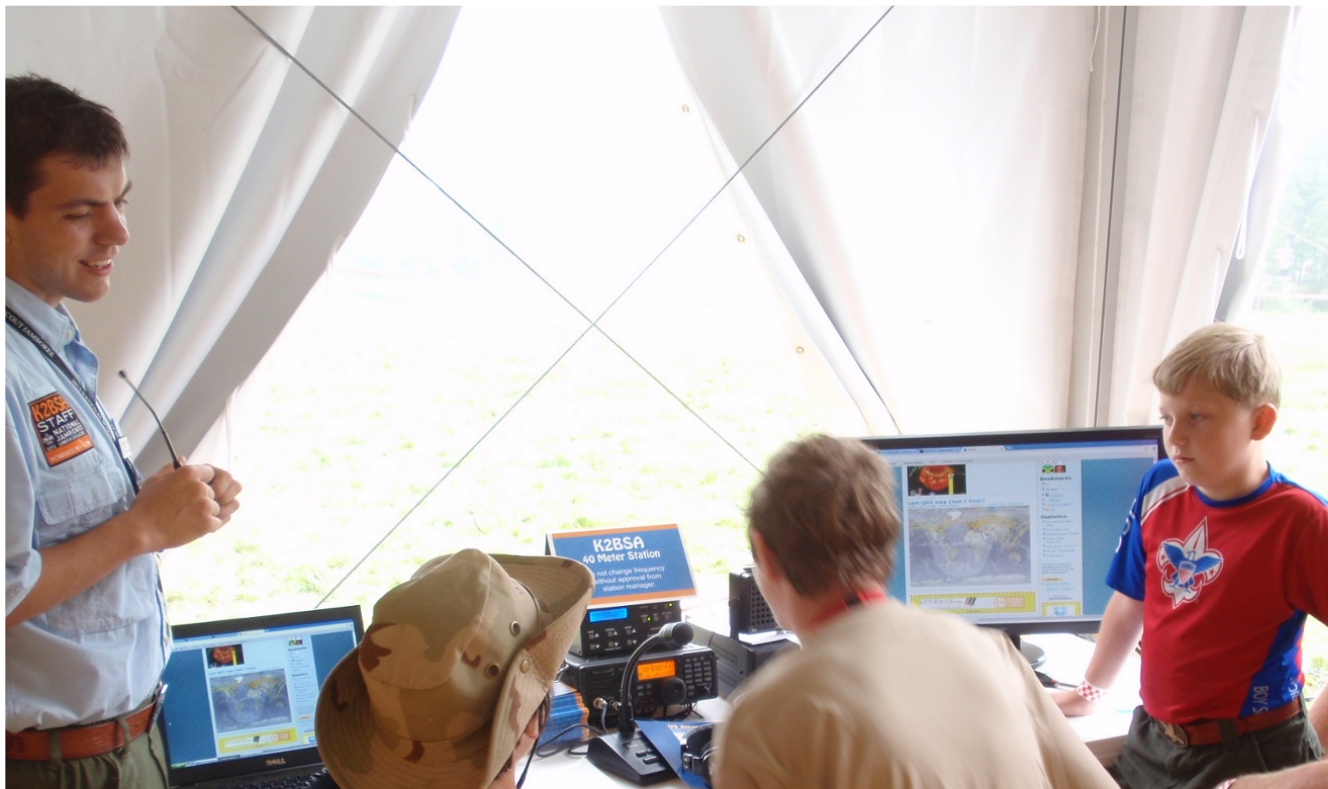
Teaching and operating with the scouts