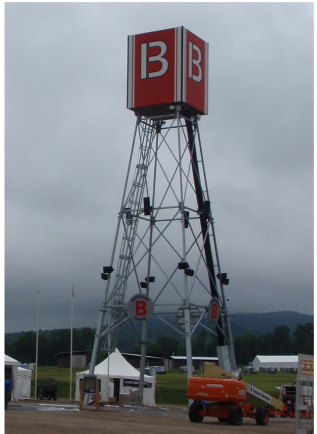
cell tower wifi antennas and load speaker tower