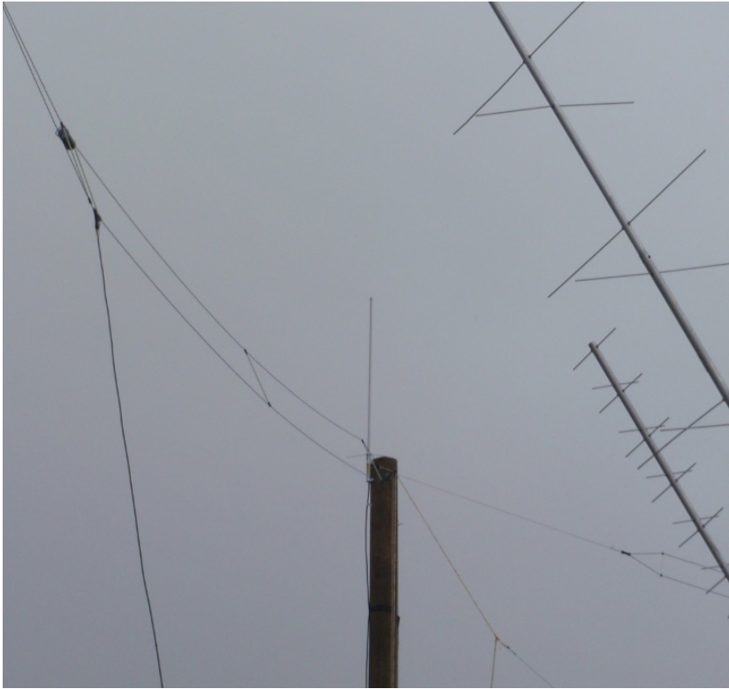
K2BSA satalite antenna and a horizantal dipole in back ground