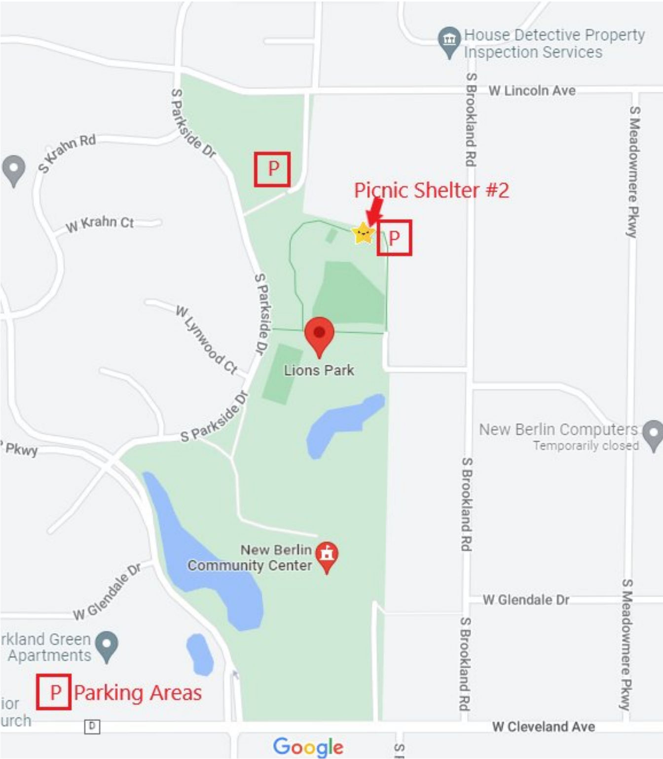
August pizza meeting map Picnic shelter #2